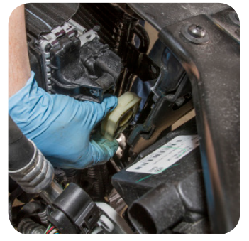
FIG. 31B REV.Sept.2015